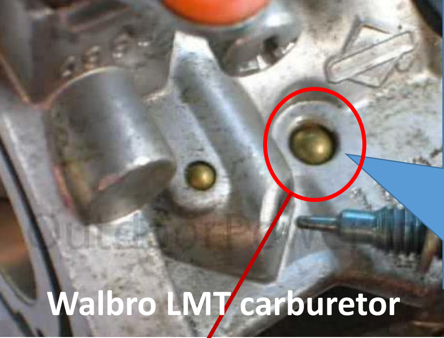
Walbro LMT carburetor

Symptom; Engine won't idle, engine surges at idle speed. , You've cleaned the carb 2 or 3 times and your going nuts. Cause= The carburetor idle passage is restricted.